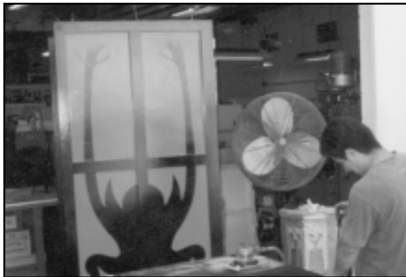
The Mysteries from the Devil's Chamber apparatus is partially disassembled at California's Owen Magic Supreme for painting and repairs.

Apparitions, Phantoms and Ghouls will SCARE the YELL out of you!