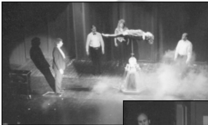
The spine-tingling Impated Beyond Belief illusion, as presented in the 1995 edition of "Illusions in the Night." It returns in 2001.

This is a show that attracts repeat guests and that requires the magician to prepare never-before-seen mysteries. Five lucky young audience members will be invited onstage to "Trick-Or-Treat" with the magician. They'll each don a costume and, before they're dismissed, another youthful volunteer will attempt some Halloween mind reading.