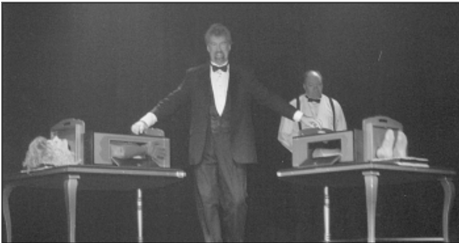
The "modern" version of SAWING as staged for John Deere's "Beyond the Limits" and on tap for Sunset Playhouse in March 2001