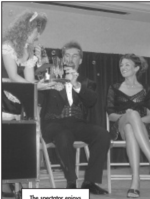
The spectator enjoys a beverage before learning a card trick to fool the magician.